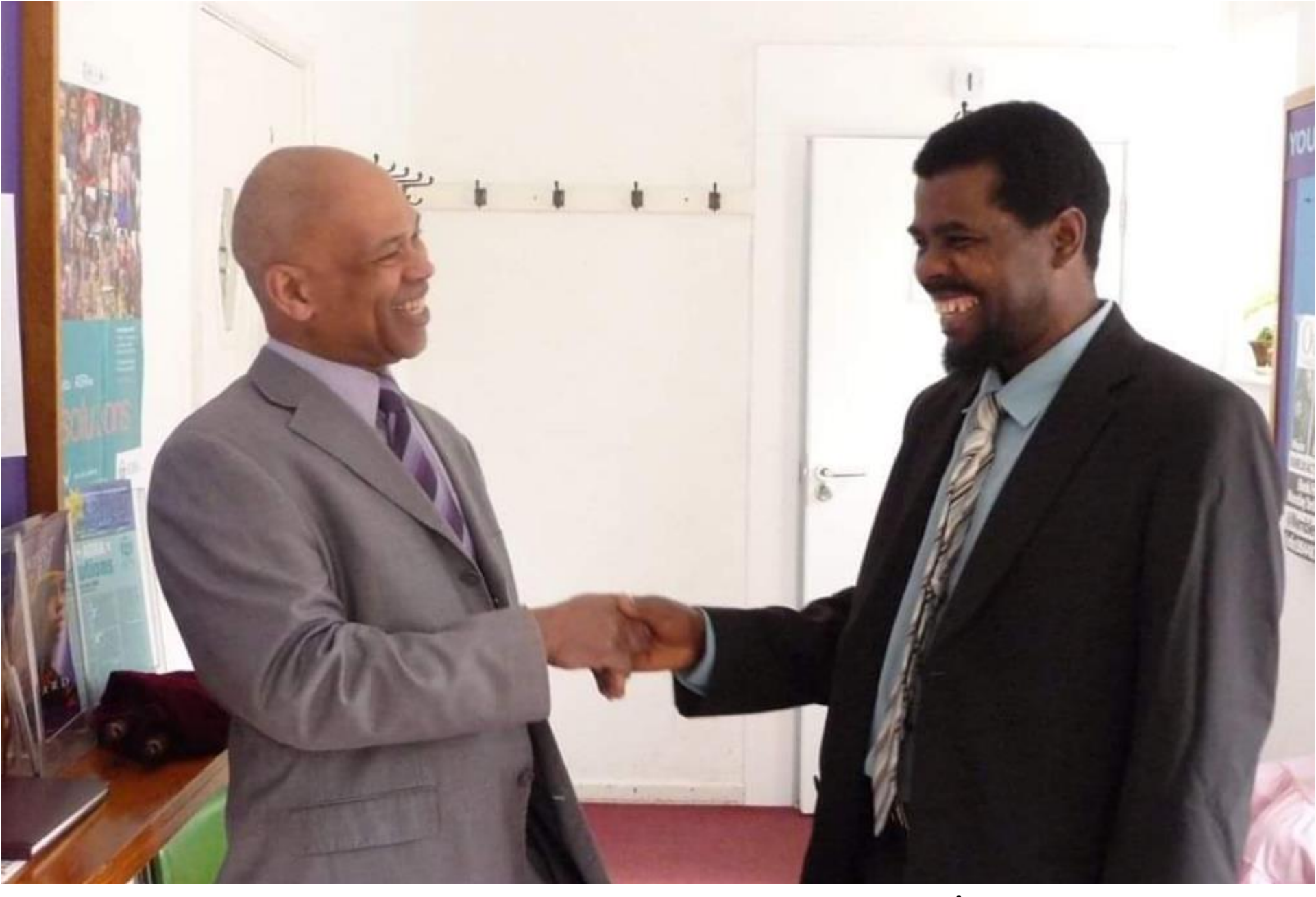
Bristol Central SDA Church Notices – 26<sup>th</sup> March 2022